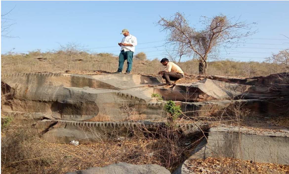
Sone Valley Geological Survey by Applied Geology Students