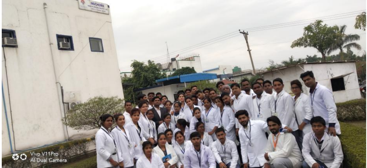
IndchemieHealth Specialities Pvt. Ltd.HimachalVisit- 2019