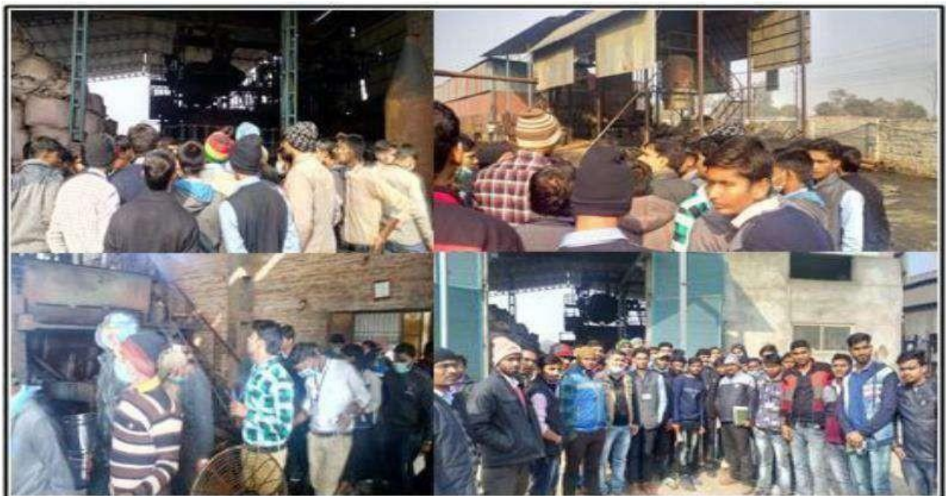
Maurya wire netting limited industry visit