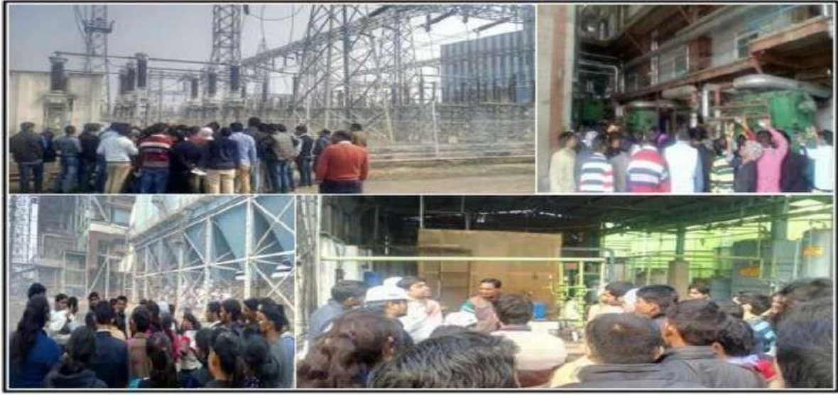
Abhinav Steels & Power Plant Visit