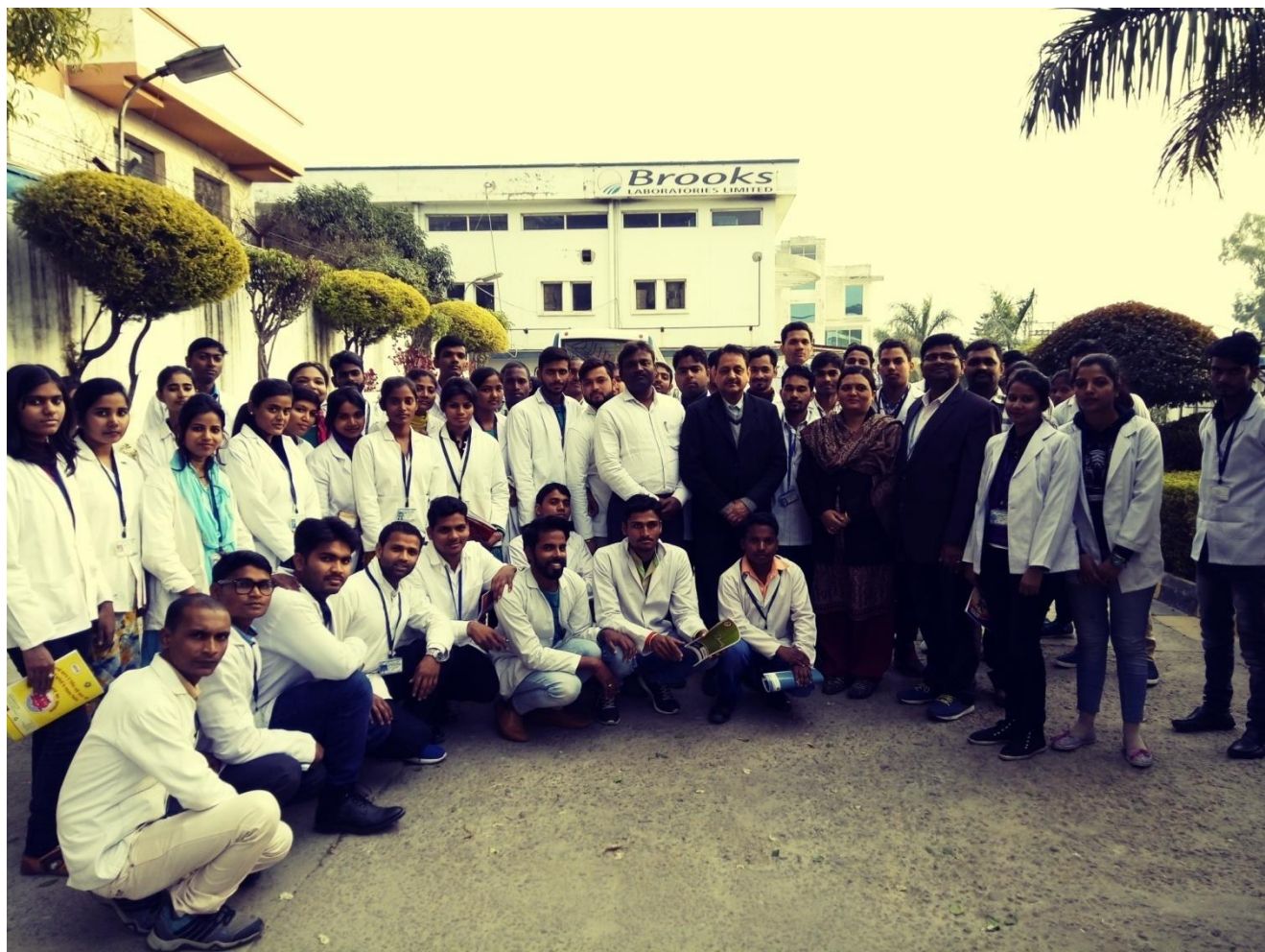
Brooks Laboratories Limited, Baddi Visit 2018