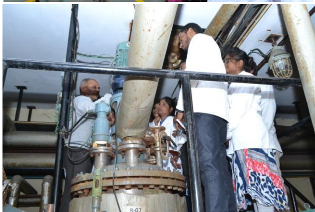
NIPER Mohali, Punjab Visit-2019